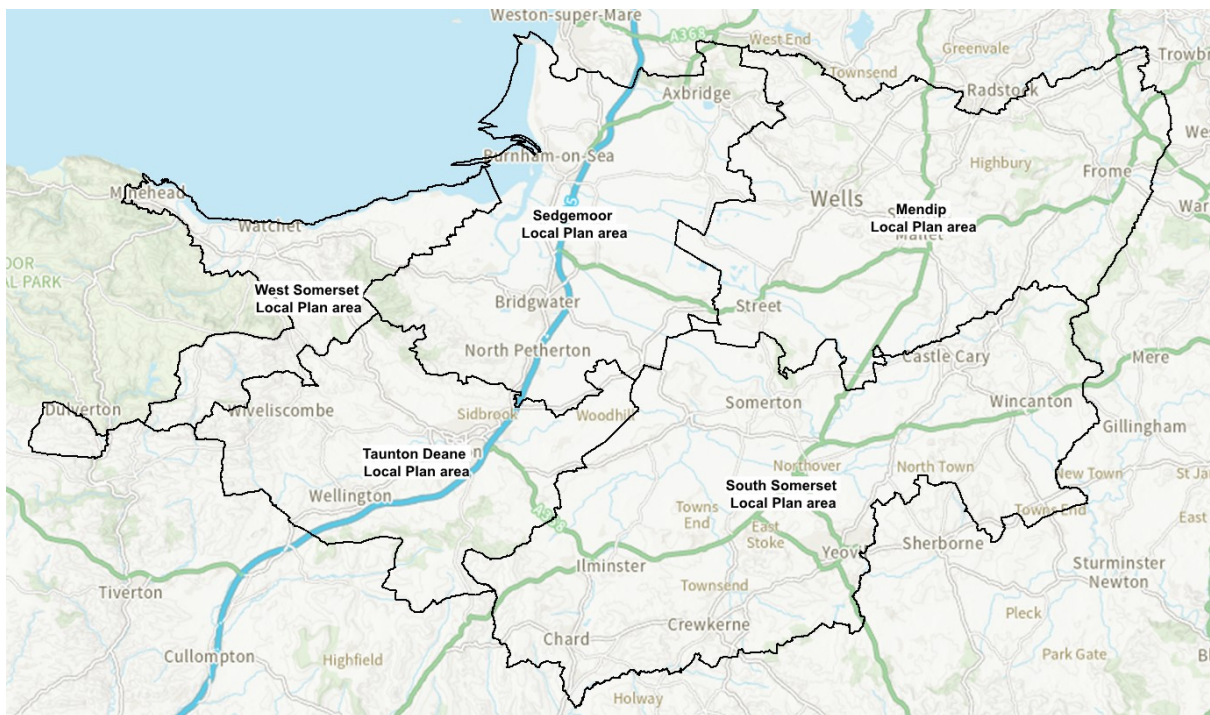
Table 1 lists the adopted Development Plan documents for Somerset Council. The documents can be viewed at https://www.somerset.gov.uk/planning-buildings-and-land/adopted-local-plans/

This means that the existing Development Plans of the former council's will remain in place for their relevant geographical areas of Somerset Council until they are replaced by one or more Development Plan documents.